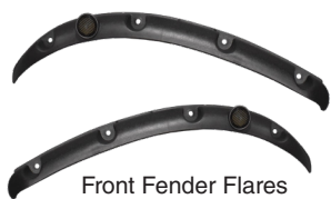
Front Fender Flares