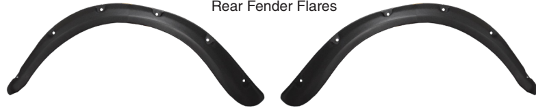
Rear Fender Flares