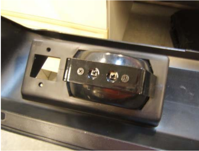
Light Mounting Bracket.

end cap drill 3/16" holes where the original rivets were removed. Install the rivets to the end cap to body.