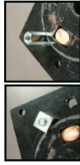
Figure 1 - Replace Stop