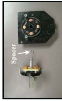
Figure 3 - Install Spacer