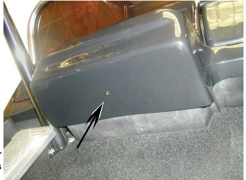
View from under cup holders

Using door and frame as a template, drill 1/8" pilot holes in each corner. Insert screws and tighten with #2 phillips screwdriver.