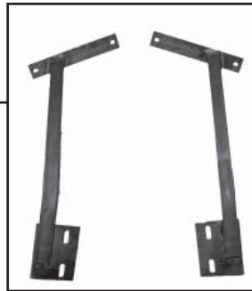
R.H. L.H. Mounting Arms