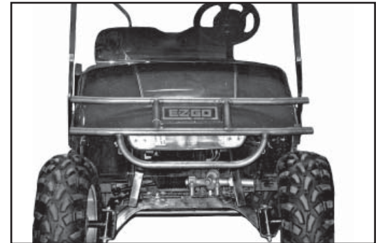
Shown with optional lights (not included)