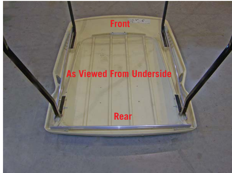
Rear Rail Placement