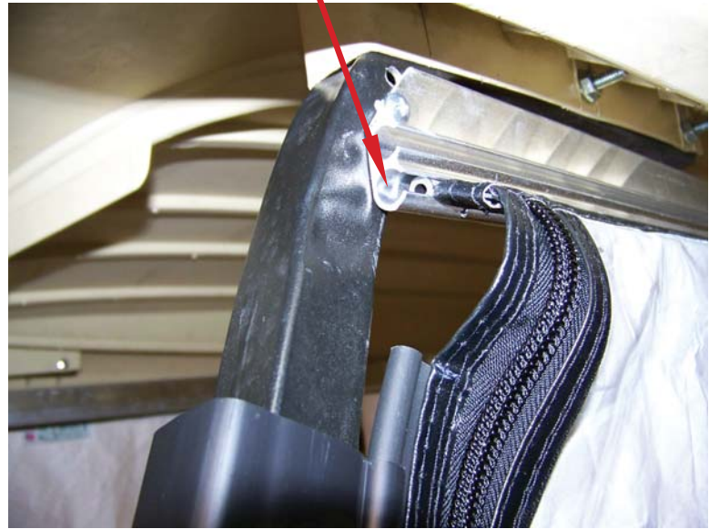
Front Side Rail Screw Placement