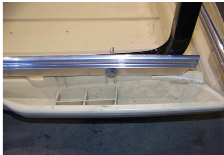
Rear Strut Single Bolt Mount