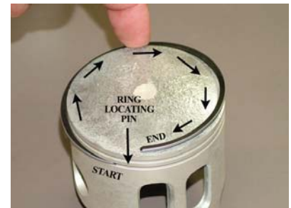
Figure 1 - Install rings