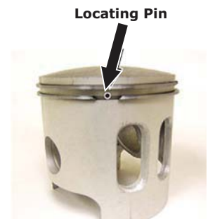
Figure 2 - Ring Locating Pin