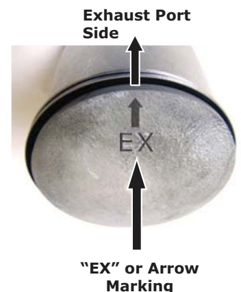
Figure 3 - Piston Installation