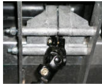
Step 6: Attach the U-Joint to the column and retighten the U-Joint bolt and the column support bolts.