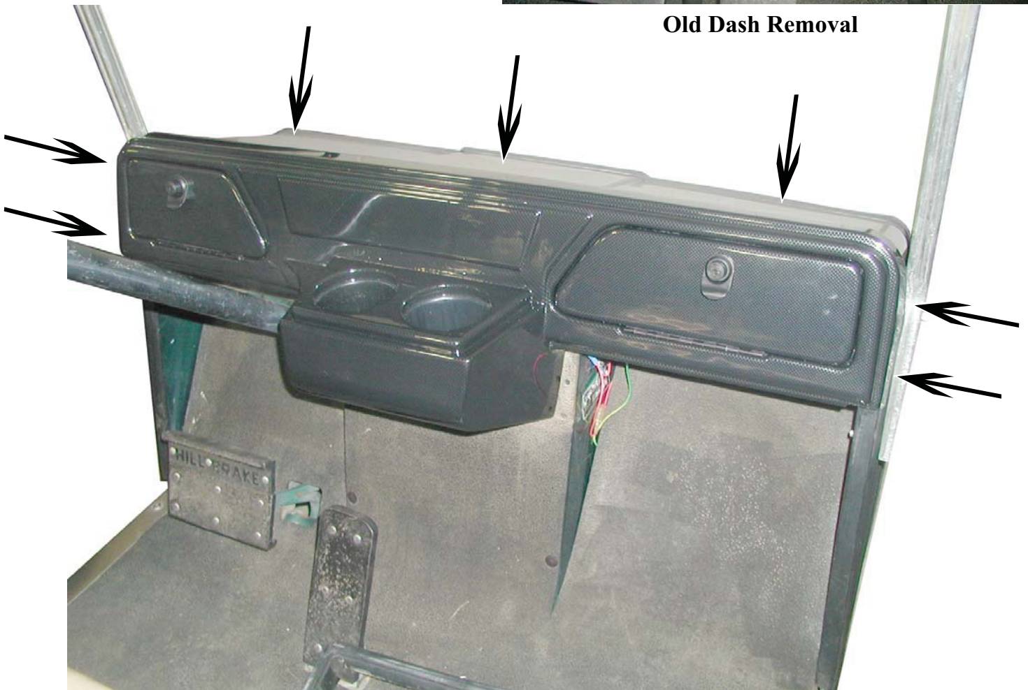
Old Dash Removal

Buggies Unlimited 1-888-444-9994 www.buggiesunlimited.com